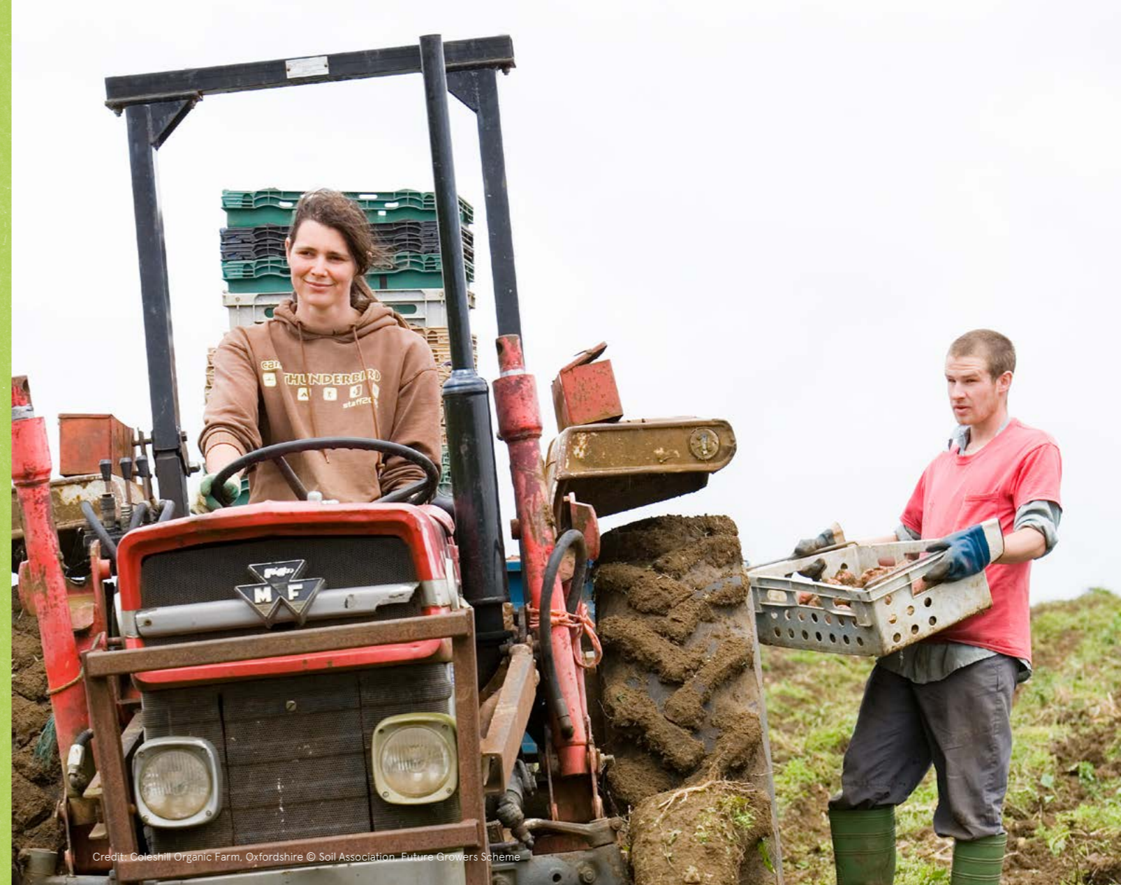
Credit: Coleshill Organic Farm, Oxfordshire © Soil Association, Future Growers Scheme

KIERRA BOX Friends of the Earth (A People's Food Policy consultation)