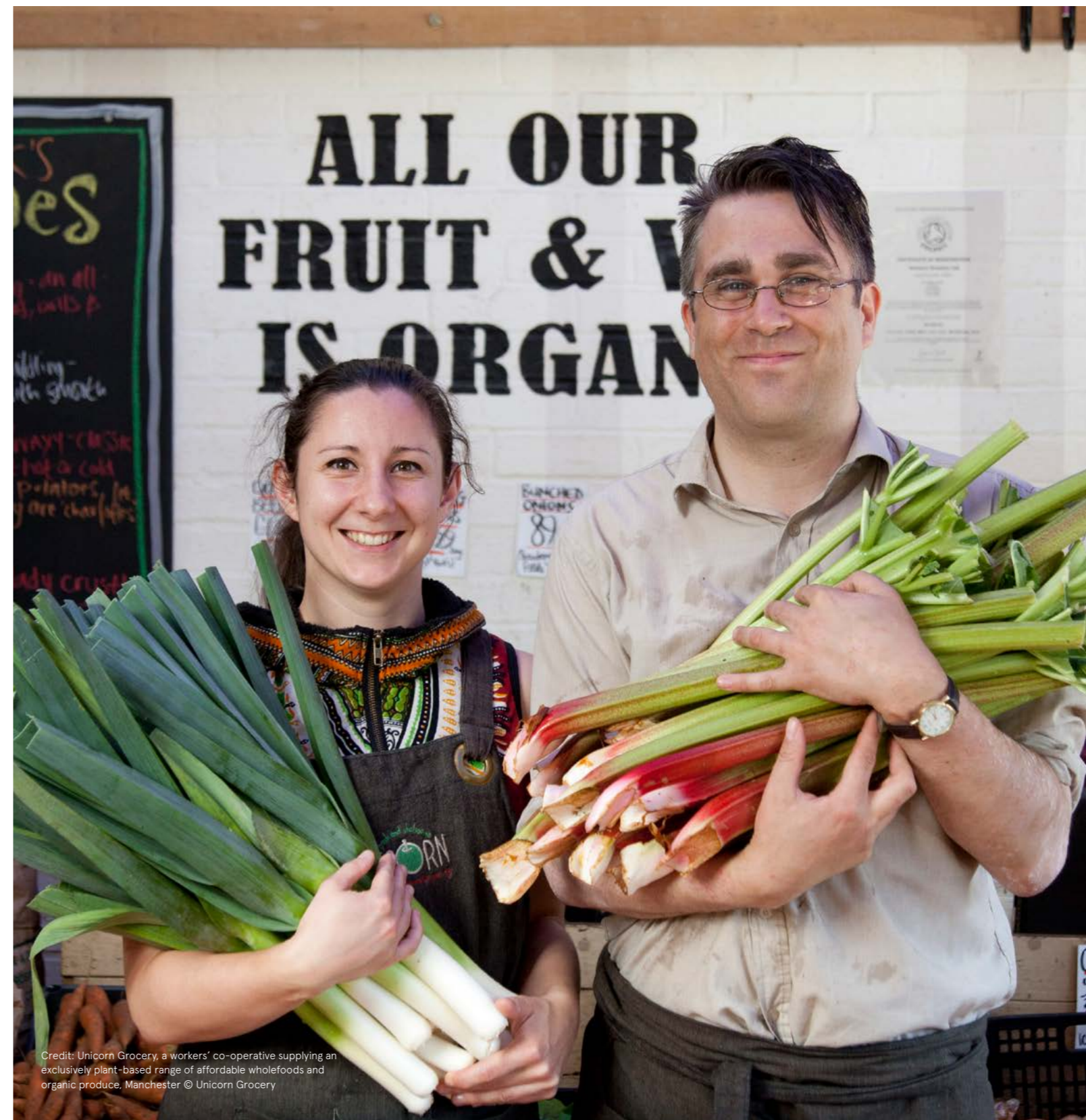
Credit: Unicorn Grocery, a workers' co-operative supplying an exclusively plant-based range of affordable wholefoods and organic produce, Manchester © Unicorn Grocery

traded as a commodity in speculative financial markets and this must be curbed. With hundreds of millions of people malnourished in a world with enough food to feed everybody, agriculture must not be used as a bargaining chip in global trade deals. As agricultural trade rules are negotiated, the special nature of agriculture needs to be taken into full consideration.