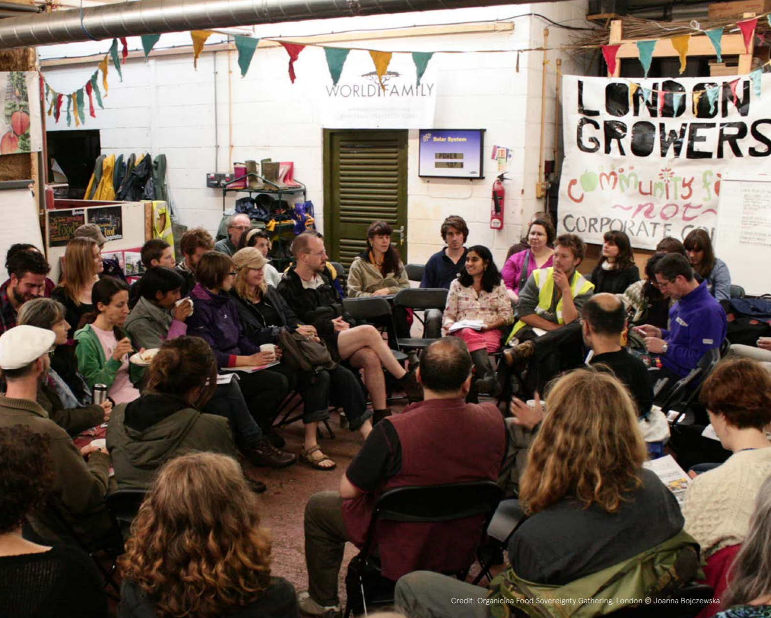
Credit: Organiclea Food Sovereignty Gathering, London © Joanna Bojczewska