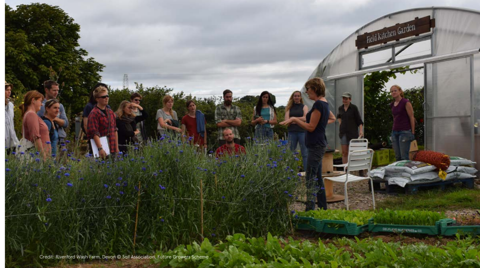
Credit: Riverford Wash Farm, Devon © Soil Association, Future Growers Scheme