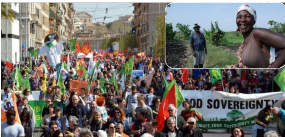
LVC campaigning is linked to basic and in-depth agroecology, as well as education that increases food sovereignty and self-governance.

La Via Campesina (LVC) brings together and represents about 200 million peasants, small and medium-size farmers, landless people, women farmers, indigenous people, migrants and agricultural workers around the world. Founded in 1993, LVC involves 182 member organisations in 81 countries across Africa, Asia, Europe and the Americas.