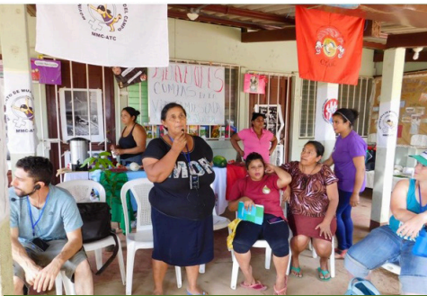
The Gloria Quintanilla Women's Coop, Nicaragua