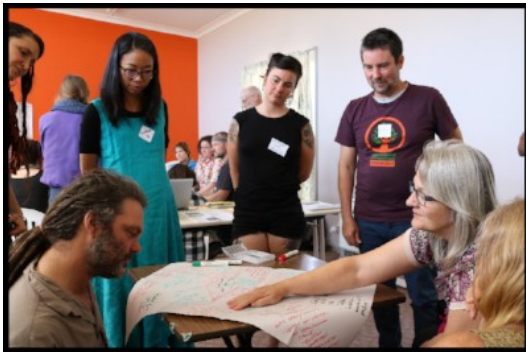
At the Australasian Permaculture Convergence brainstorming IPEN potential activities and actions