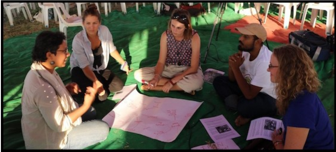
An IPEN discussion group at the IPC India global CoLab session