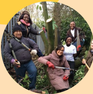
Join or start a local group, connect with people near you.